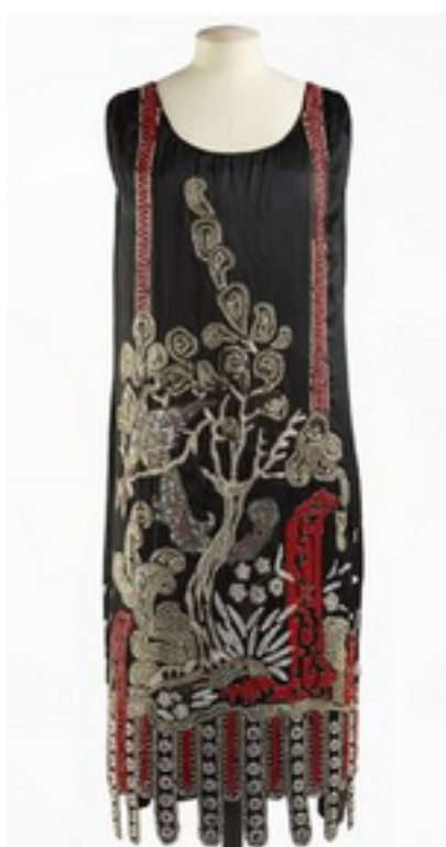
Musee Galliera, Ville de Paris

Paris Haute Couture, Paris There's vintage, and then there's historic couture. This show of 100 dresses is the latter. The selection from the Musée Galliera collection — from late-19th-century Worth evening gowns (a 1925 Jean Patou dress is shown right) to an intricately embroidered outfit by John Galliano for Christian Dior — is on view at Paris's City Hall through July 6.